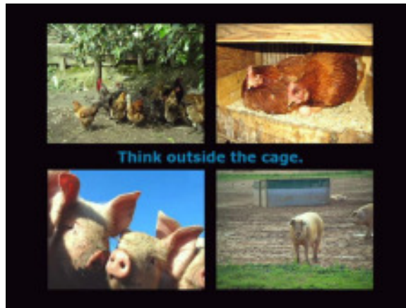
Scenes from CCFA’s new PSA, Think outside the cage

CCFA’s new 30-second PSA, Think outside the cage , is being rolled out. The PSA features Canadian images of caged hens and crated sows, with a request to consumers to “Think outside the cage.” Toronto tech expert Vlad Malik produced