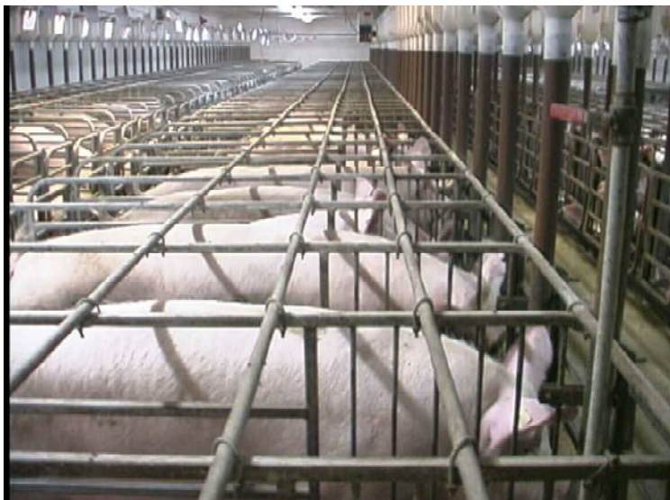
Pregnant sows in stalls

Earlier, NFU’s Manitoba branch (Region 5), passed a motion advocating legislation to ban sow stalls in the province by 2017 – the year CCFA and CETFA advocate, and the year Maple Leaf Foods has committed to ending sow stalls in Manitoba.